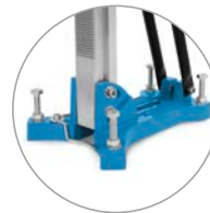
Compact dowel foot