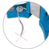
Integrated centre indicator