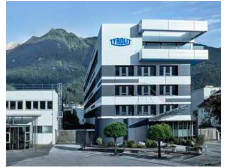
Tyrolit headquarters in Schwaz (Austria)

The family-owned company based in Schwaz, Austria, combines the dynamic strengths of the Swarovski Group with over a hundred years of commercial and technological experience.