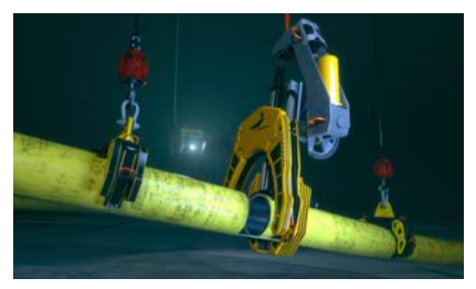
USA, Gulf of Mexico Underwater cutting operations