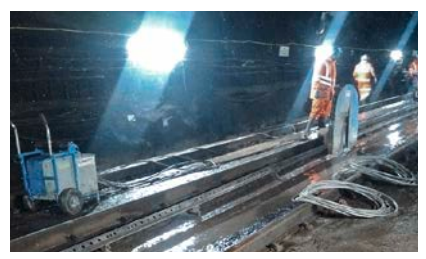
GREAT BRITAIN, Glasgow Renovation of Queen Street Tunnel