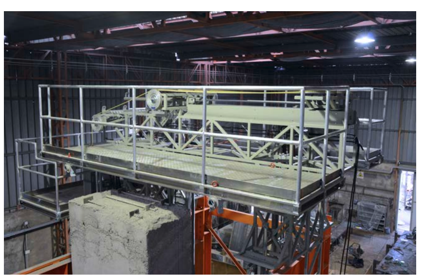
Large, stationary wire saws for the nuclear industry, developed by Studio Corvi.