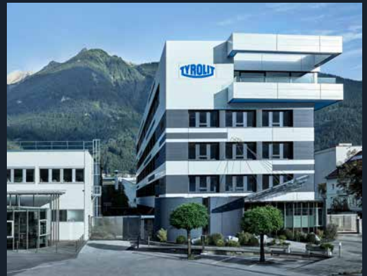
The TYROLIT headquarters in Schwaz, Austria.

Subscribe our channel youtube.com/TYROLITgroup